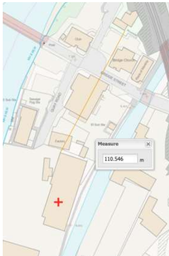
Plan Indicating Distance from Unit 9 Gym to 1-3 Bridge Street

Additionally given the industrial nature of the area it is not anticipated that the increased level of traffic at such times would be sufficient to result in any adverse impacts relating to noise and disturbance on the single residential property. The proposed variation of condition in relation to opening hours is therefore considered to be compliant with Policies EN8 and BE1 of the Neath Port Talbot Local Development Plan.