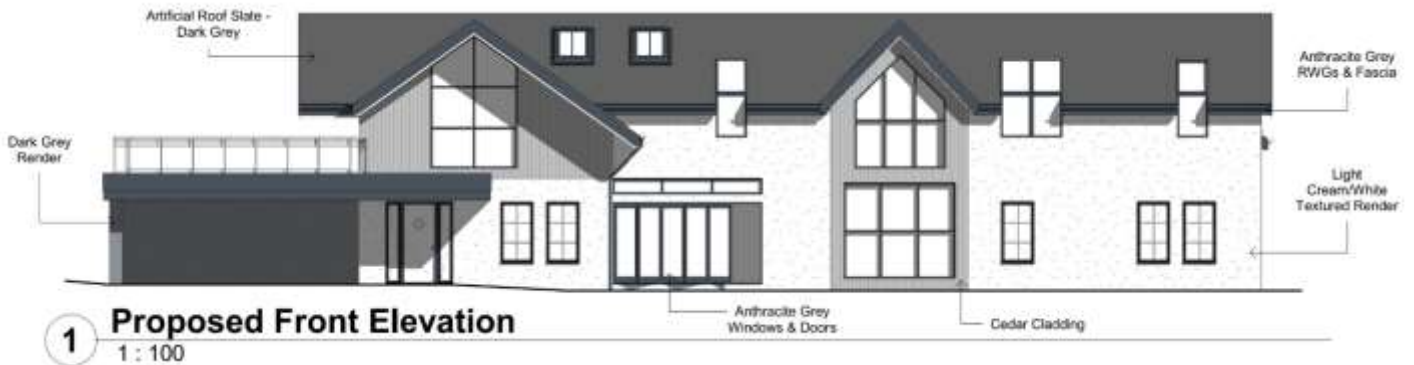
1 Proposed Front Elevation 1 : 100